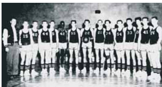
1955-56 Basketball Team (p. 196)

The San Diego Union picked Mission Bay to finished ahead of Kearny, Pt. Loma and La Jolla in the CPL. The basis for this prediction