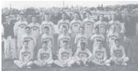
1956 Track Team (p. 196)

As expected, Hoover won the City Prep League Finals at Balboa Stadium.