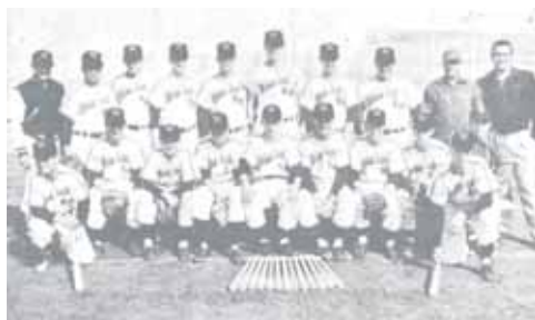
1956 Baseball Team (p. 196)

In rating the City Prep teams in the local newspaper, mention was made that Mission Bay could use an all-Brooklyn bat-