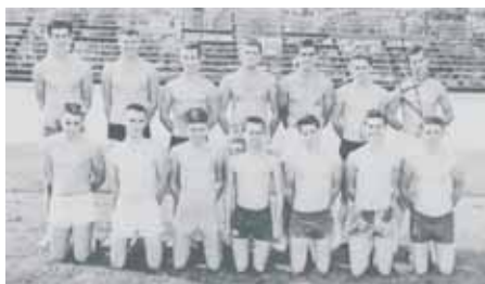
1956 Swim Team (p. 196)