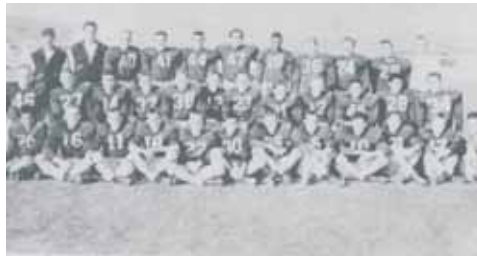
1955 Football Team (p. 196)